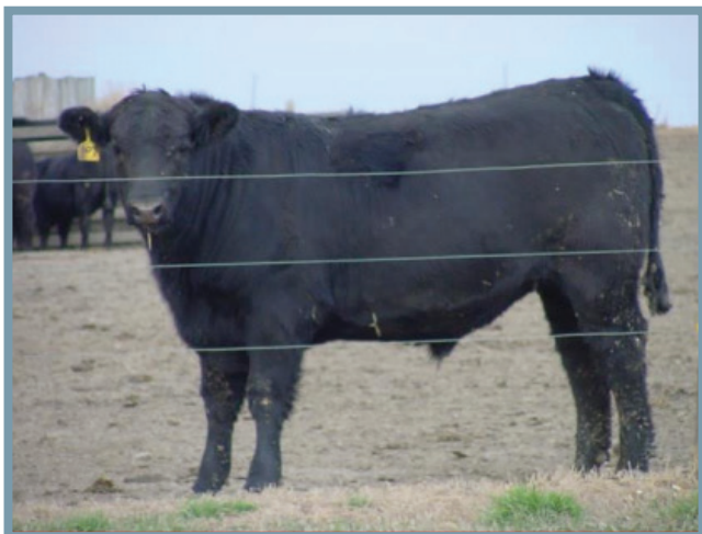
Mud and Manure Score 1