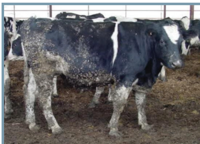
Mud and Manure Score 4