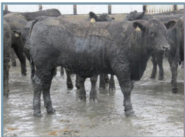
Mud and Manure Score 5