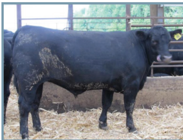
Mud and Manure Score 2