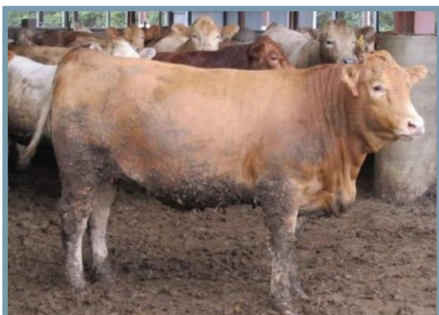
Mud and Manure Score 3